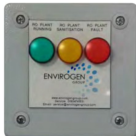
Remote wall-mounted alarm indicator