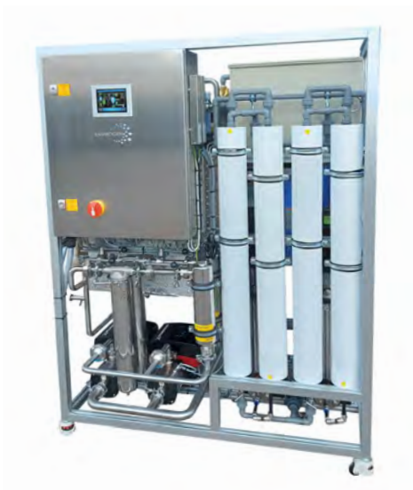
An EndoTherm Duo duplex RO System